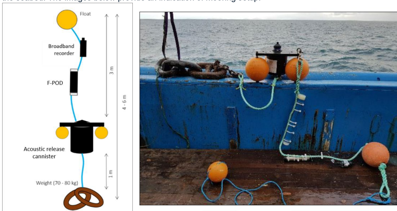
Figure 1 PAM mooring configuration

Five moorings were deployed in September 2024 and then recovered, maintained and replaced in February/March 2025 and June 2025, as advised by previous Notices to Mariners. The PAM survey will now conclude as planned after one year and so the moorings will now be recovered and removed by the vessel Ruby May . The PAM moorings are each composed of an anchor weight, rope with acoustic release system and scientific PAM equipment suspended beneath a set of floats. The PAM moorings have no surface expression (i.e. no surface marker buoy) and the top of the mooring extends approximately 4 - 6 metres above the seabed. The images below provide an indication of mooring setup.